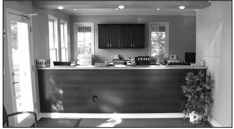
The front desk area

structural engineer and revising the building footprint to save existing shade