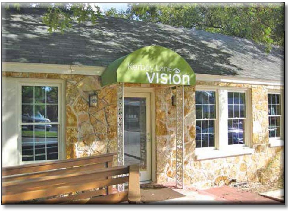
Kerbey Lane Optical

"Although not recognized as a historic site, it was our primary goal to maintain the quaint appearance of the original 1940s vintage home, but feature state-of-