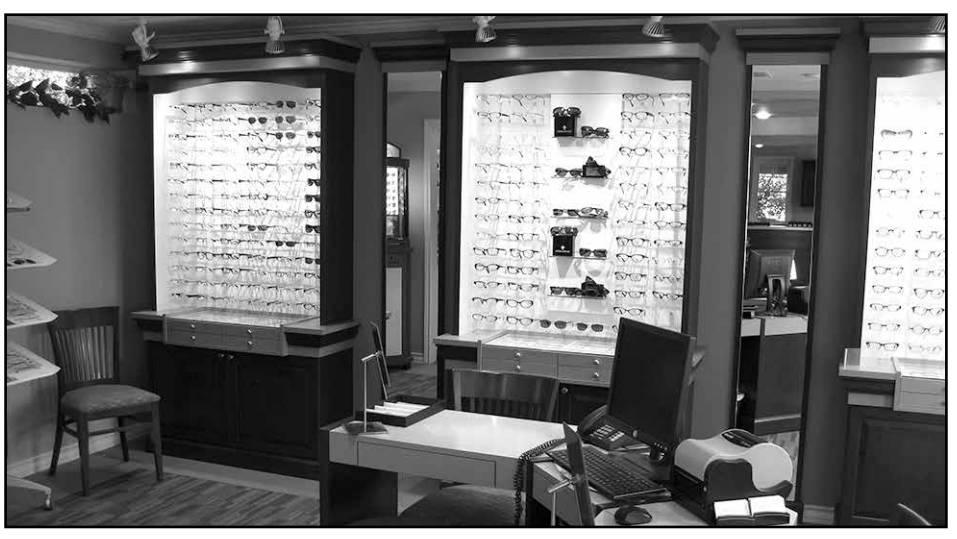
The optical area

"We contract all types of new construction projects as well as remodeling and rehabs," Van Waes said. "We began designing and building energy efficient, eco friendly structures way before it was cool to do so. The first house I designed in 1983 had passive solar features as well as radiant barrier. Over the last 32 years, we have completed many wood, steel and concrete structures of all sizes, some over 30,000 sf." -ab