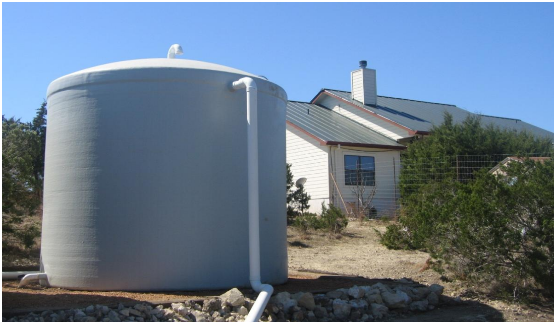
5,000 gallon fiberglass tank

Prices subject to change without notice. Please contact us at 512-490-0932 for final pricing.