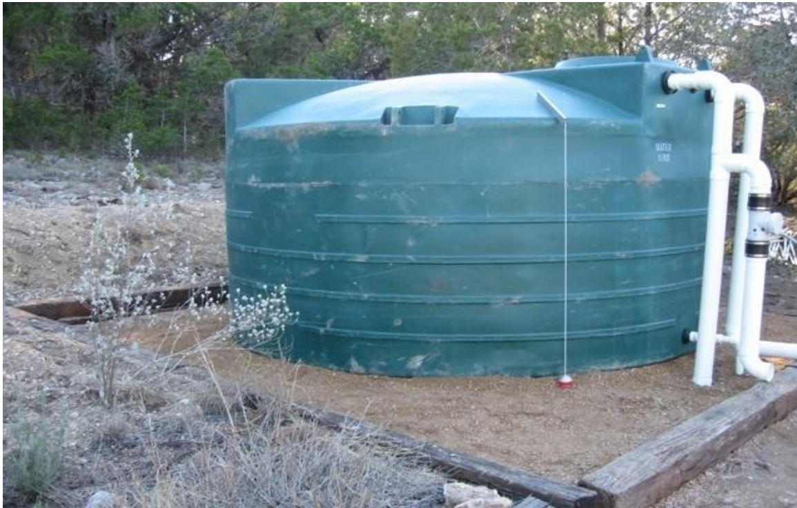
5,000 gallon green polyethylene

Prices subject to change without notice. Please contact us at 512-490-0932 for final pricing.