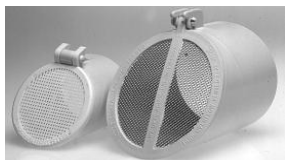
Insect Pipe Flap