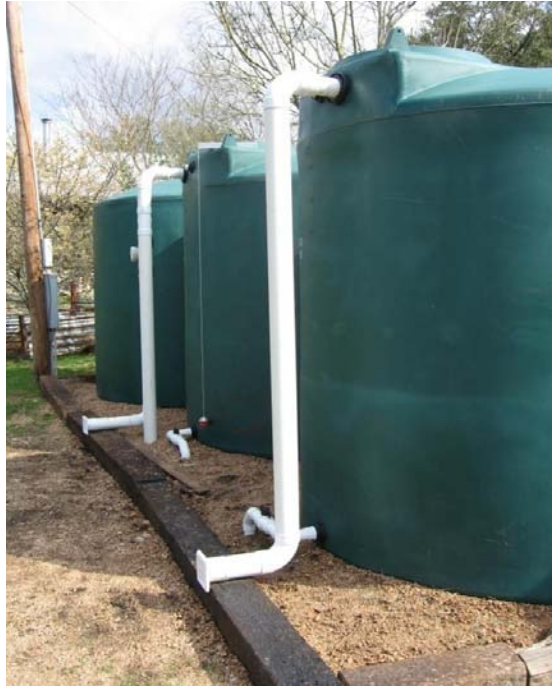
(3) 3,000 gallon green polyethylene

Delivery costs: Varies depending on shipping carrier and location