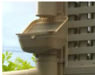
Leaf Eater Advanced