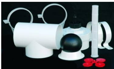
Downspout Diverter kit