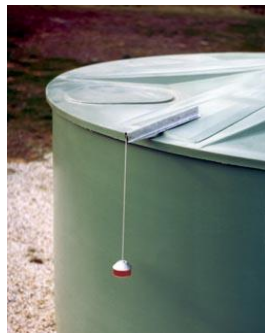
Levetator level gauge