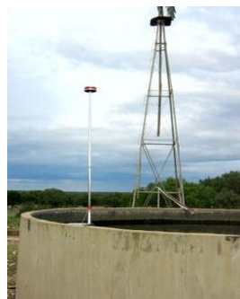
Dipstick level gauge